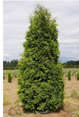
American arborvitae - Thuja occidentalis 'Nigra'