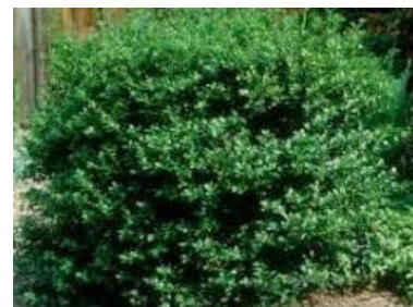
Green Lustre Japanese Holly Ilex crenata 'Green Lustre'