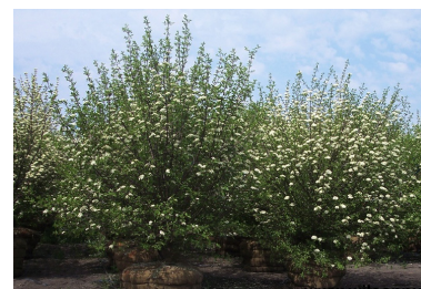
Blackhaw - Viburnum prunifolium