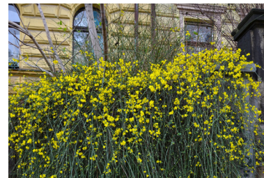
Winter Jasmine - Jasminum nudiflorum