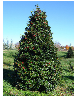
American Holly - Ilex Opaca